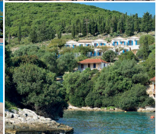
Kaminakia location (centre)