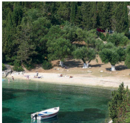
Foki beach, Fiscardo

The Apartments: Air Conditioning Self Catering Swimming Pool Studios for 2 Free WiFi Apartments for 2/4