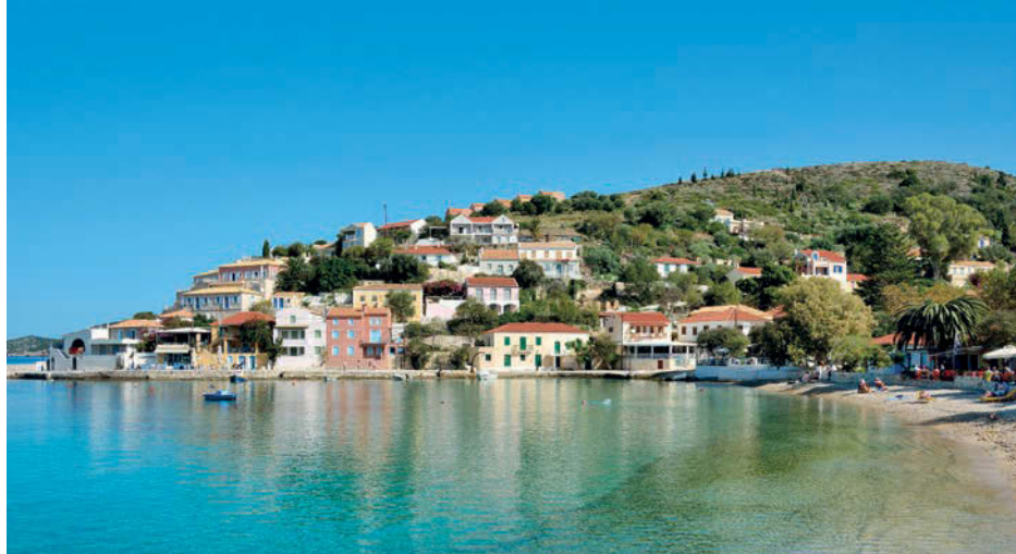
View from Apollonia Studios

The Studios: Self Catering Studios for 2