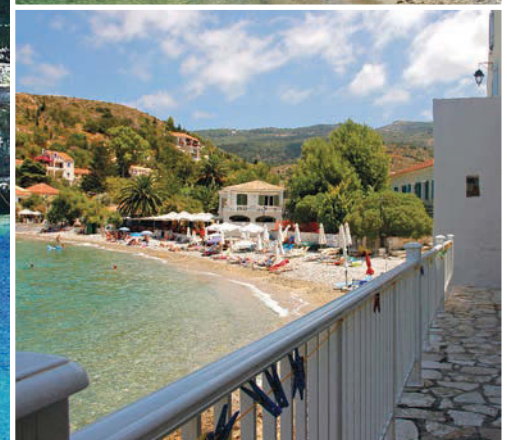
Path to the beach